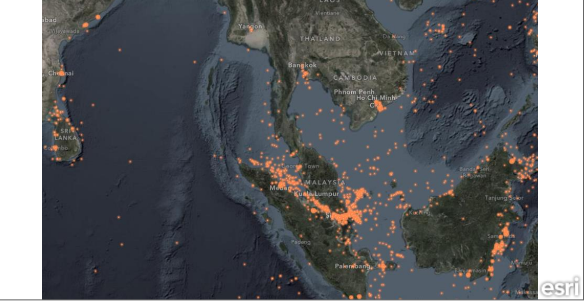
Data source: aggregations and incidents of 40 years of piracy, sourced from the US National Geospatial-Intelligence Agency's (NAG) Anti-Shipping Activity Messages (ASAM) database.<sup>19</sup> Map by John Nelson, Adventures In Mapping, 2020.