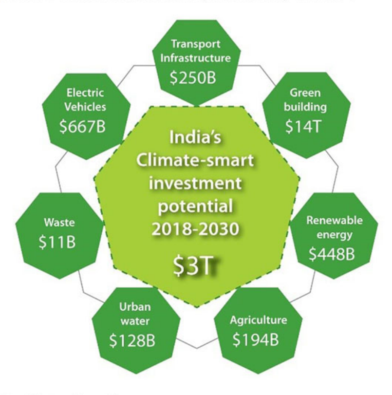
FIGURE 1: India's climate investment potential up to 2030